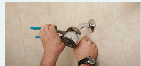
Direct install upgrades